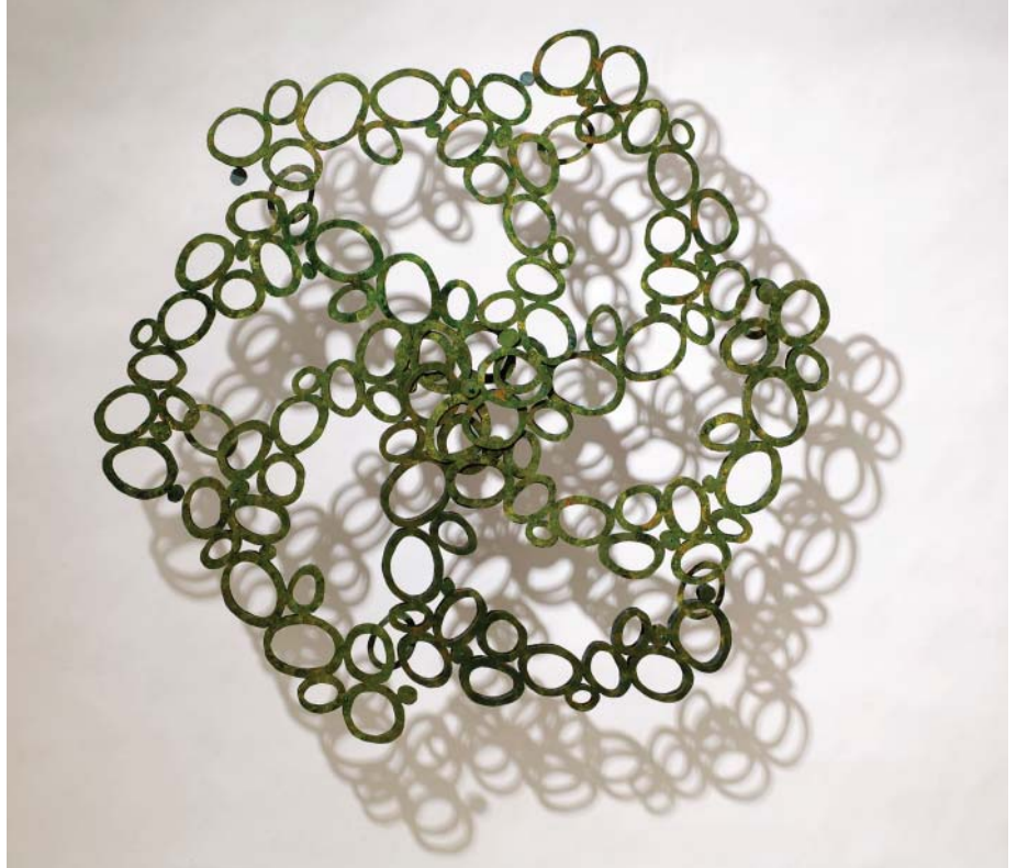
12 Times Mandala Acrylic on scrollcut wood