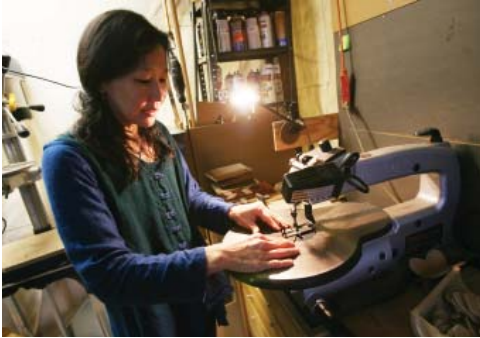
Working with a scroll saw in her Issaquah studio.