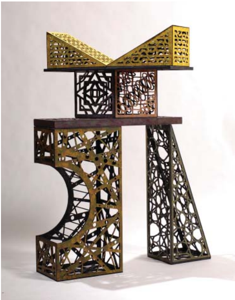
Stacked Building Boxes Acrylic on scrollcut wood